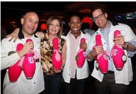
Recognize your staff