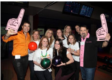
A unique way to entertain your clients!