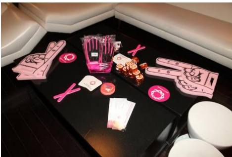
Chocolates, foam fingers, coasters, and nail files