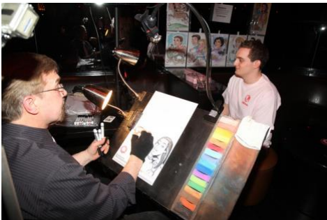
Sponsor the caricaturist