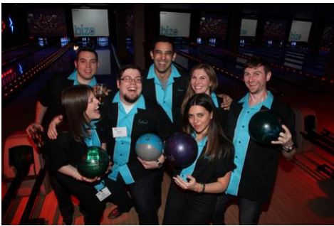
Tons of fun!