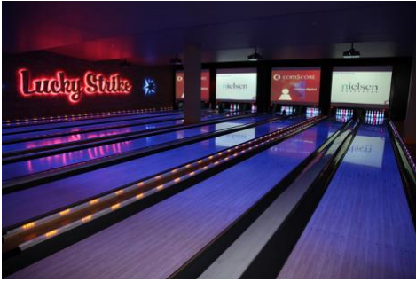
Highlight your brand on every single alley screen